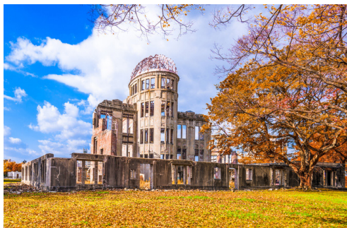
Figure 10: Peace Dome, Hiroshima (Photograph, Shutterstock.com).

The Pavilion was a fusion of both modern architecture with influences from Le Corbusier, and traditional motifs drawn from Japanese culture. 468 In a sense it encapsulates the modern-traditionalist tension in many other reconstruction projects, yet resolves them, unlike many other major undertakings. The HMPP has been the major national and international focus of remembrance of the victims of atomic bombing in Japan, drawing hundreds of thousands of visitors every year.