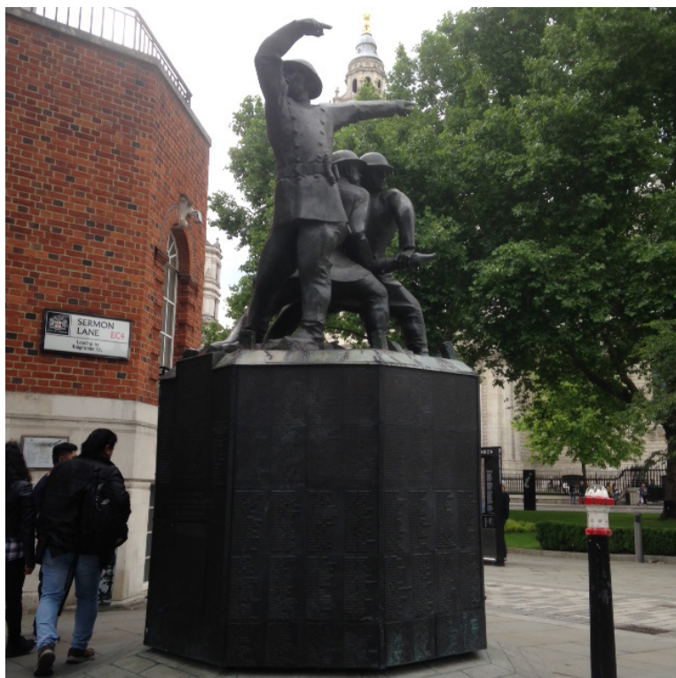
Figure 7: National Firefighter's Memorial, St. Paul's Cathedral London (photograph by author, 2017).

The heroism of the fire fighters and other members of the emergency services was the subject of some powerful documentary films made during the Second World War, as noted in chapter