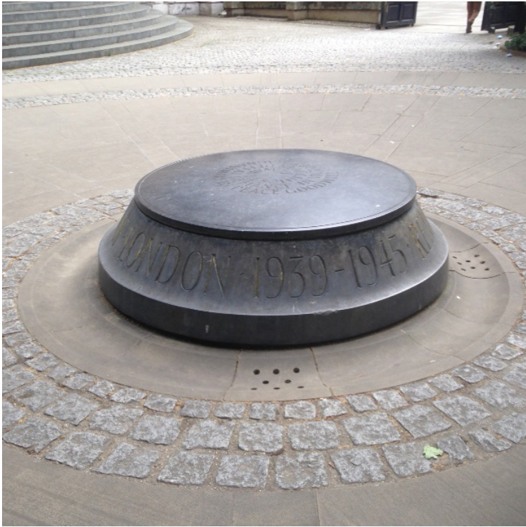
Figure 4: Memorial to the people of wartime London at St Paul's Cathedral.

counters that the survival of the cathedral means something, despite the desolation all around it: