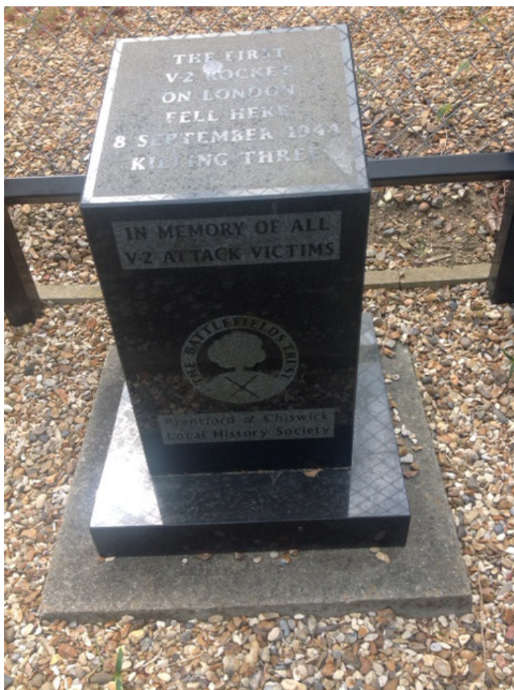
Figure 5: V2 Memorial, Chiswick, West London.