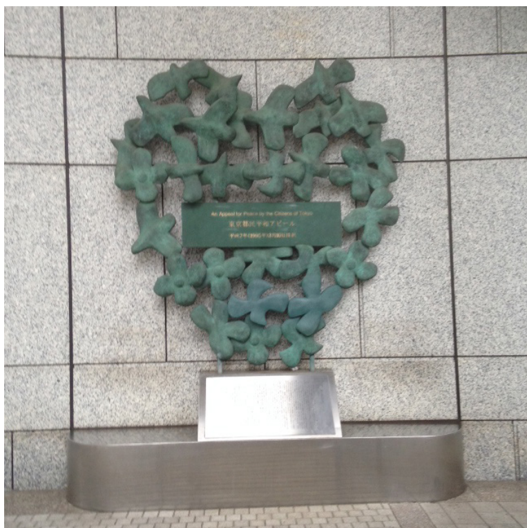
Figure 12: Anti-war sculpture in the plaza of the Tokyo Metropolitan Government Building, designed by Kenzo Tange. The inscription reads 'An appeal for peace by the citizens of Tokyo'.

In common with Bert Hardy in London, he was not going to let his fear get the better of him. The social historian Arthur Marwick