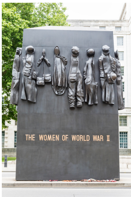
Figure 8: Monument to the Women of World War Two.

Beyond London, the National Memorial Arboretum in Staffordshire hosts the Civil Defence Memorial Grove, which recognises