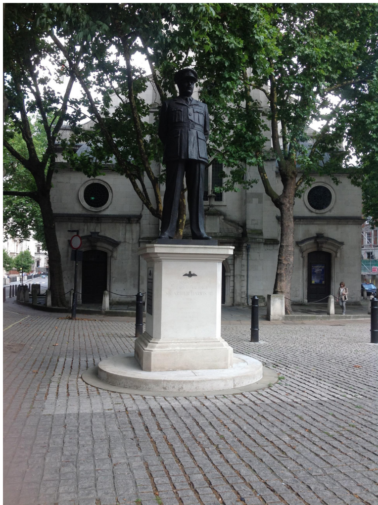
Figure 6: Statue to Sir Arthur Harris, St. Clement's Danes, Aldwych, London. The inscription reads: 'In memory of a great commander and of the brave crews of Bomber Command, more than 55,000 of whom lost their lives in the cause of freedom. The nation owes them all an immense debt'.