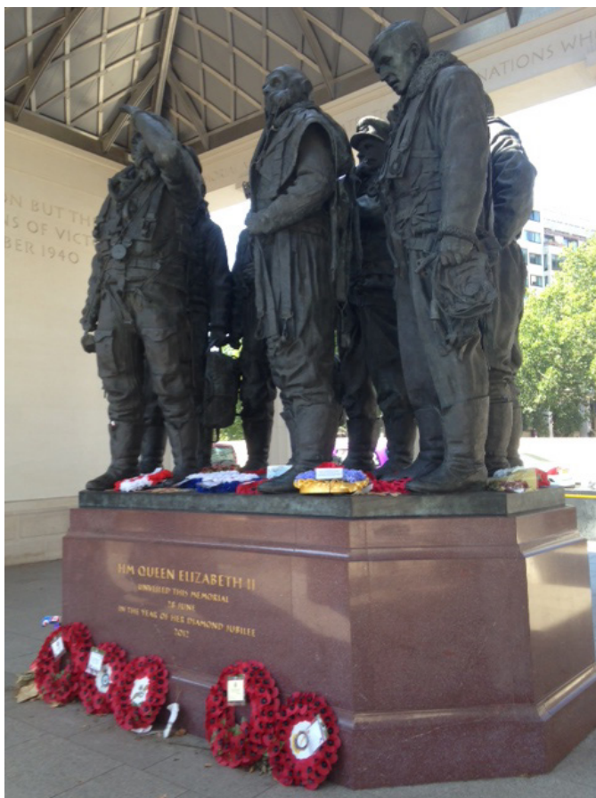
Figure 9: The Bomber Command Memorial, Green Park London. In addition to the 55573 air crew killed, the memorial also commemorates ‘those of all nations who lost their lives in the bombing of 1939–1945’. Hence it reflects the globalisation of memorialisation.

former enemies. It received less condemnation than the statue to Arthur Harris. 459