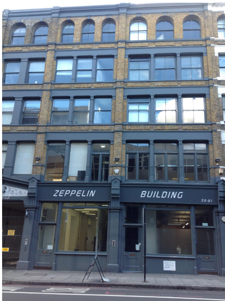
Figure 1: The Zeppelin Building, Farringdon, East-Central London (photograph by author, 2017).

further west. London was an obvious objective for the Germans, however. The air raids in the First World War drew an early pattern of incursion and destruction that would be more widely replicated in the Second World War. Among the first areas of London