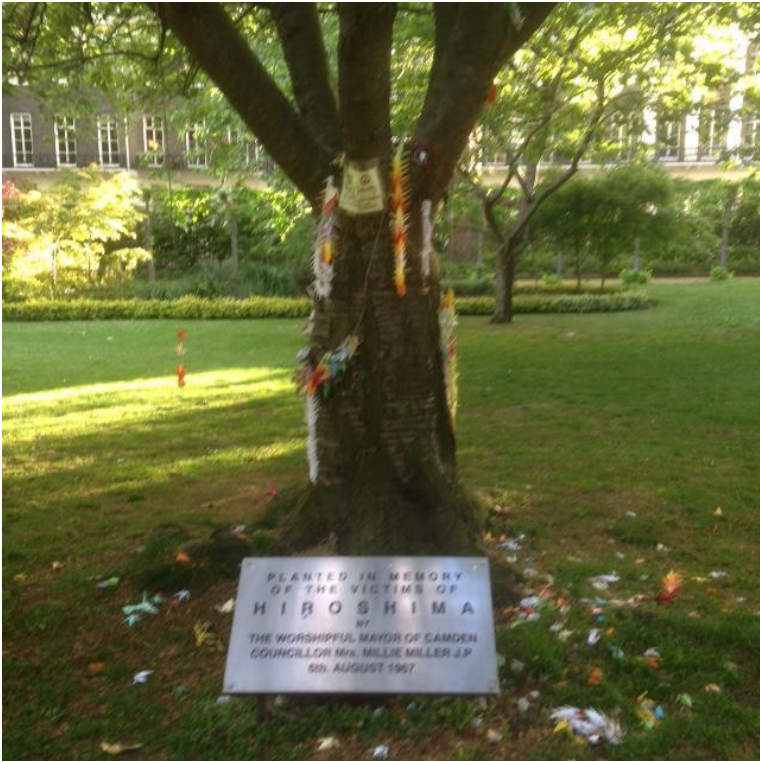
Figure 11: Hibakusha Memorial Tree, 1967, Tavistock Square, London, another symbol of the global presence of hibakusha memorialisation in a world city (photograph by author, 2017).

unite the different sites of commemoration that stemmed from the tragedies of the Second World War. 480 Yet the equation of the atomic bombings with the deliberate industrialised incineration, gassing and torture of 6 million Jewish people by the Nazi regime was by no means convincing. And of course, both Germany and Japan were former Axis partners.