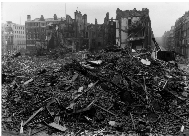
Figure 3: Bomb damage to Hallam Street, London.

across roads and streets. During the first weeks of the Blitz the physical destruction and the accumulation of debris was so extensive that about 1,800 roads were blocked, while over 3 million tons of rubble and detritus had built up, requiring an extensive clearing-up and repair operation to the infrastructure of the capital city. 70 Barrage balloons had done little to stem the tide of German attacks, and the air raid warning siren was no longer sounding for practice or to indicate a few lone bombers. To make matters worse, during the first two nights the anti-aircraft guns were largely impotent, unable to bring down large numbers of German aircraft, and even failing to fire properly in some installations. As Winston Churchill noted in his history of the Second World War, first published in 1959, when the anti-aircraft artillery finally launched its salvoes into the London night, many hud-